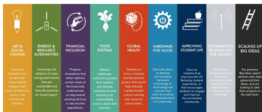
Online Information Session

Missed last week's info session or writing workshop? Watch the recordings below!