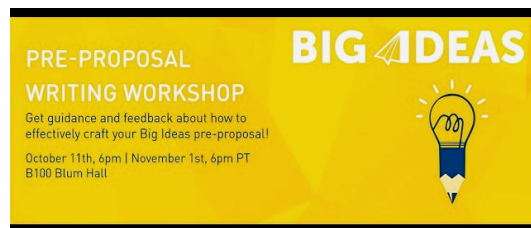
Pre-proposal Writing Workshop